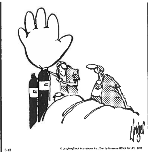
"Quit fooling around!"

Monday, Aug. 12 Keno draw were: 2, 7, 9, 10, 11, 15, 16, 18, 22, 24, 41, 42, 45, 49, 51, 52, 57, 58, 66, 69